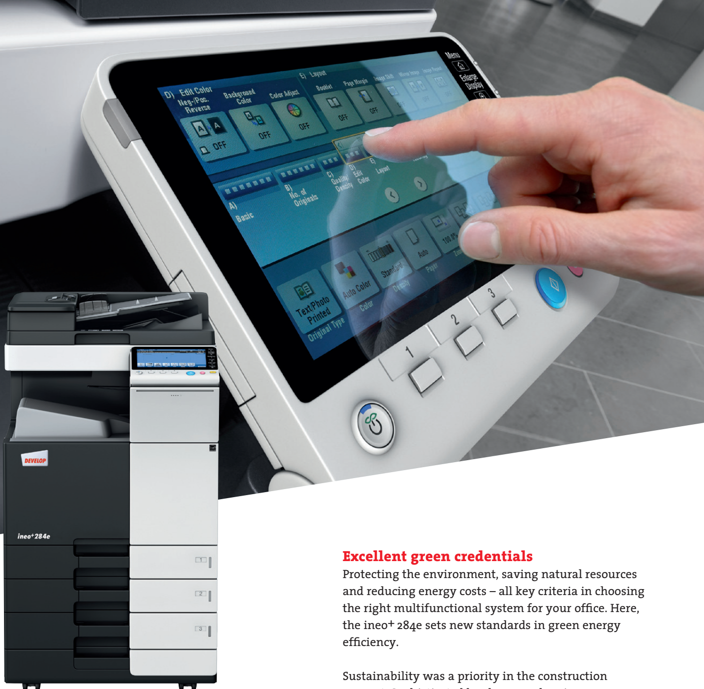
ineo+ 284e with paper feeder (PC-210) and dual scan document feeder (DF-701)