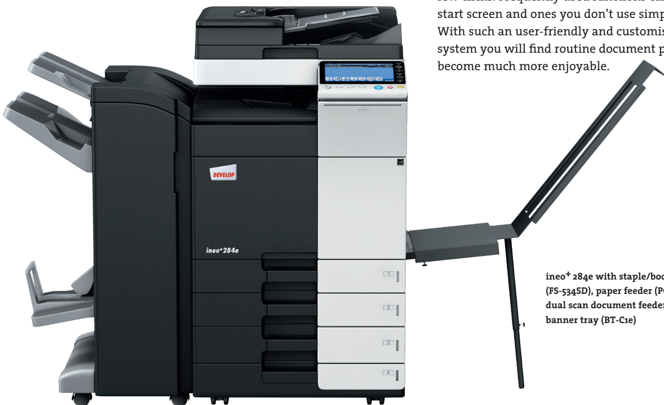
ineo+ 284e with staple/booklet finisher (FS-534SD), paper feeder (PC-210), dual scan document feeder (DF-701), banner tray (BT-C1e)

Many multifunctional office systems are anything but user-friendly. The ineo+ 284e, in contrast, is simplicity itself. An intuitive, easily understandable operating concept ensures that it is as easy to use as your smartphone or tablet. The 9-inch capacitive touchscreen comes with familiar multi-touch operations such as flick, drag&drop and pinch in&out – so you will feel at home in this system in no time at all. Thanks to a new menu navigation structure you can see all functions in one go and select the settings you want with just a few clicks. Frequently used functions can be left on the start screen and ones you don't use simply removed. With such a user-friendly and customisable office system you will find routine document production jobs become much more enjoyable.